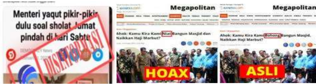
Image 1. About Hoax News